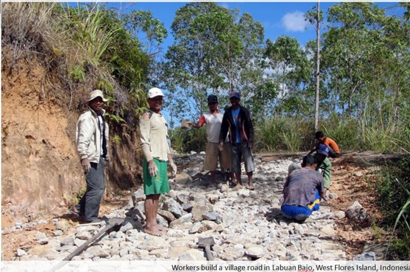
Workers build a village road in Labuan Bajo, West Flores Island, Indonesia

Provide construction personnel with the knowledge to identify environmental issues and best practice methods to minimize environmental impact.