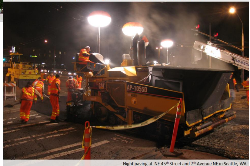
Night paving at NE 45 th Street and 7 th Avenue NE in Seattle, WA

Improve work-zone safety by using best practice methods to minimize injury risk.