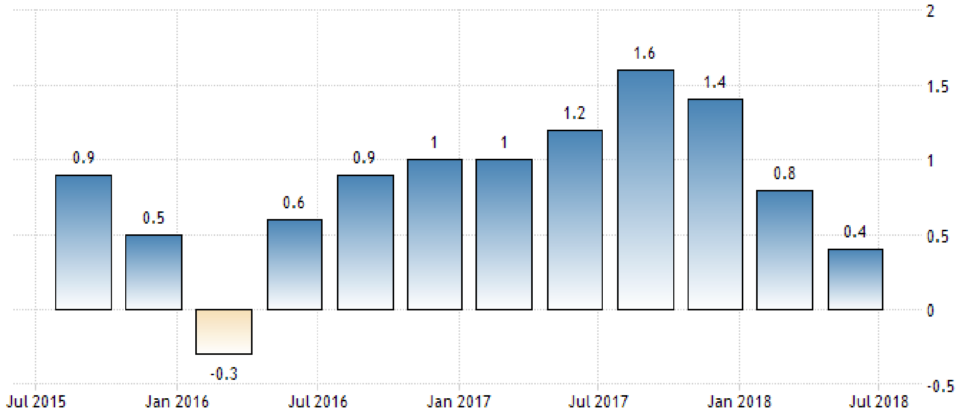
SOUTH AFRICA GDP ANNUAL GROWTH RATE